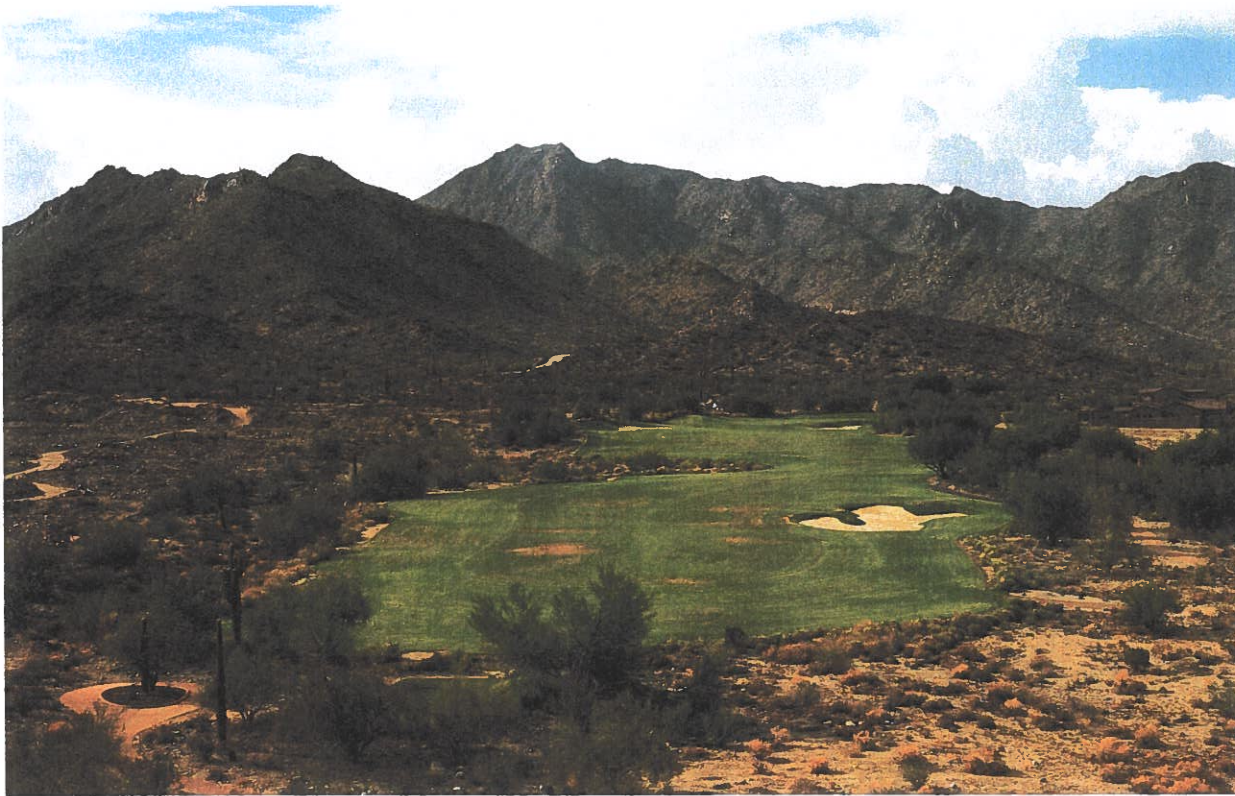
In metro Phoenix, golf courses and megaresorts have materialized on terrain better suited to saguaro and mesquite.

end of a long-term shift in climate, a region-wide drying out that is driven in large part by human-made carbon pollution.