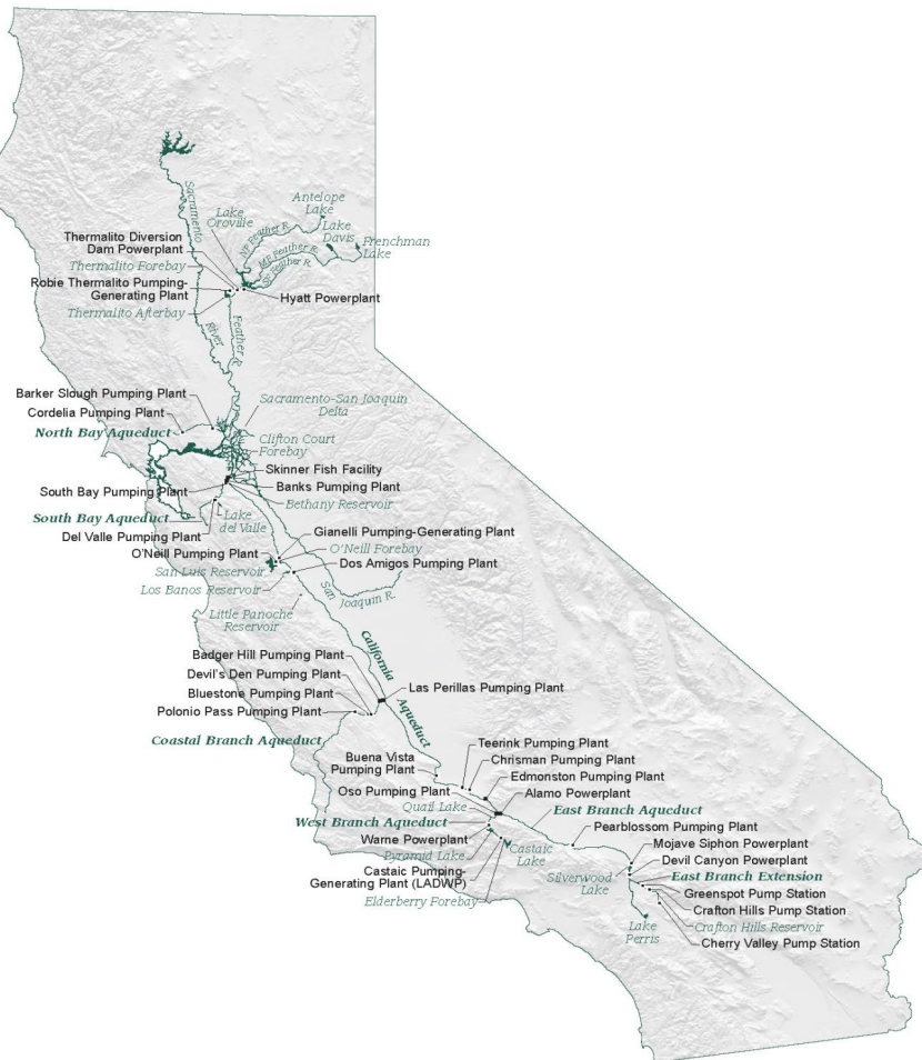
Figure 1. Facilities of the State Water Project

The SWP consists of a complex system of dams, reservoirs, power plants, pumping plants, canals and aqueducts to deliver water. See Figure 1. SWP water consists of water from rainfall and snowmelt runoff that is captured and stored in SWP conservation facilities and then delivered through SWP transportation facilities to water agencies and districts located throughout the Upper Feather River, Bay Area, Central Valley, Central Coast, and Southern California. In addition to the delivery of SWP water, the SWP is also used to convey transfers of SWP water and non-SWP water. Metropolitan receives water from the SWP through the California Aqueduct, which is 444 miles long, and at four delivery points near the northern and eastern boundaries of Metropolitan's service area.