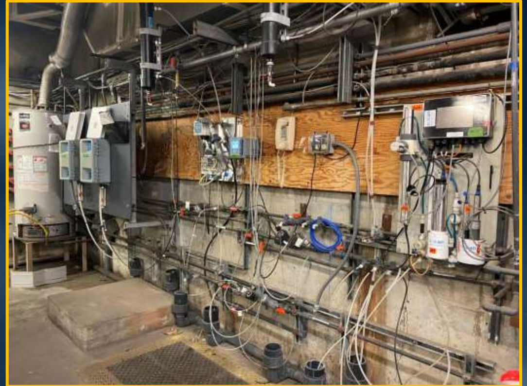
Existing Water Quality Instruments in the Administration Building Basement