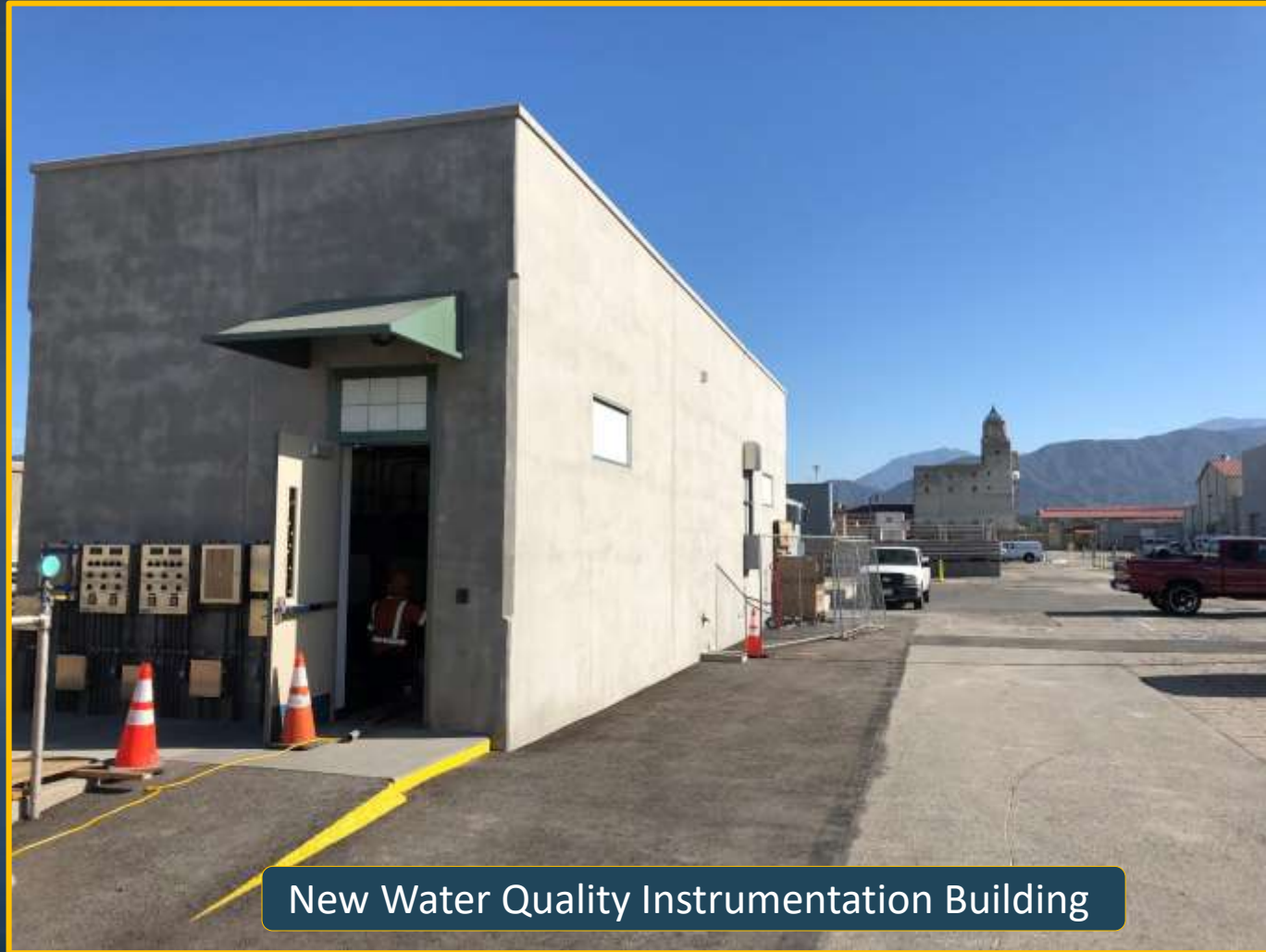
New Water Quality Instrumentation Building