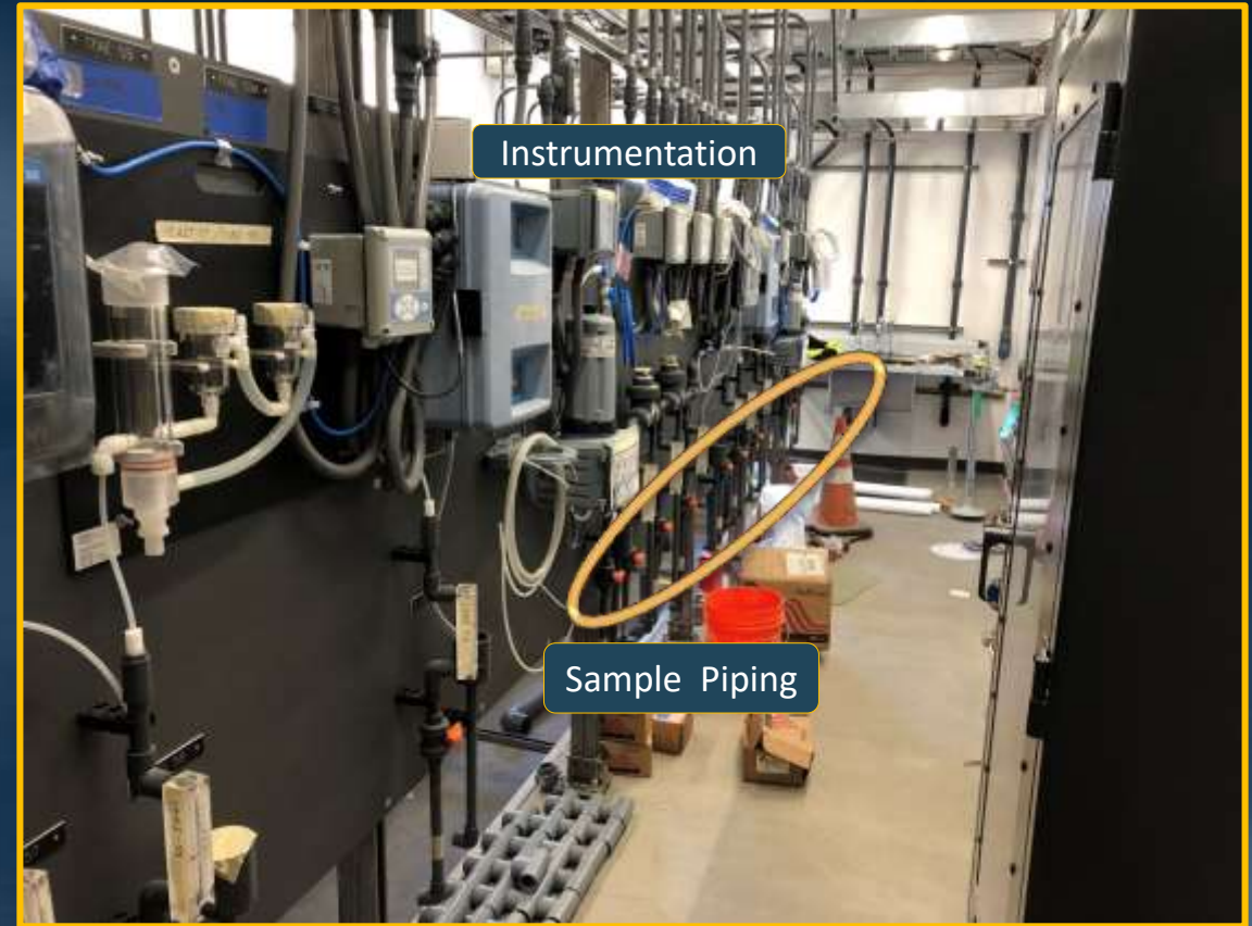
Installation of New Instrumentation and Panels