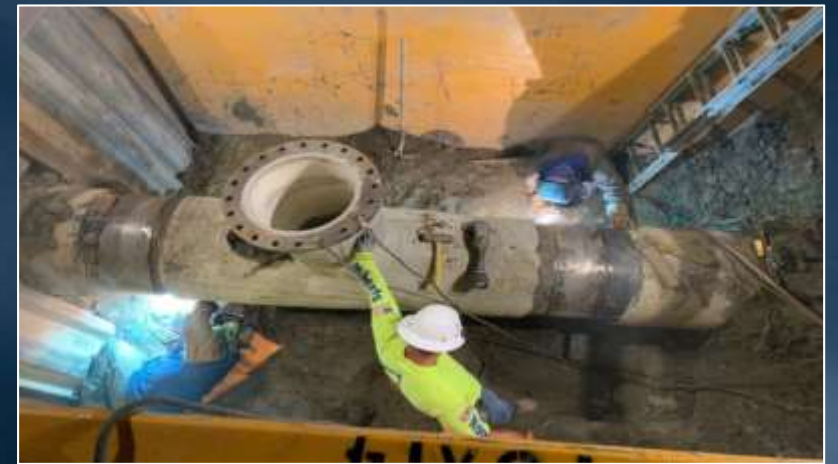
SCWD installing butt strap joint on pipeline