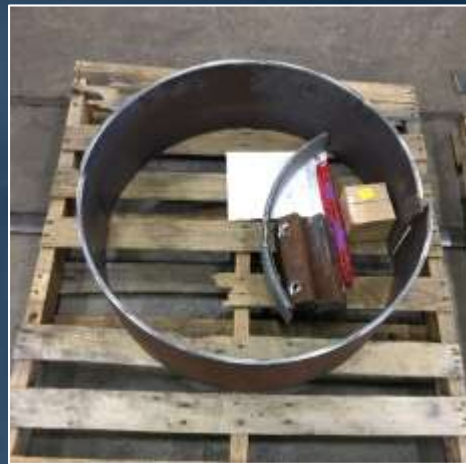
Butt strap joint fabrication (left) and materials and hardware (right) to be provided to SCWD