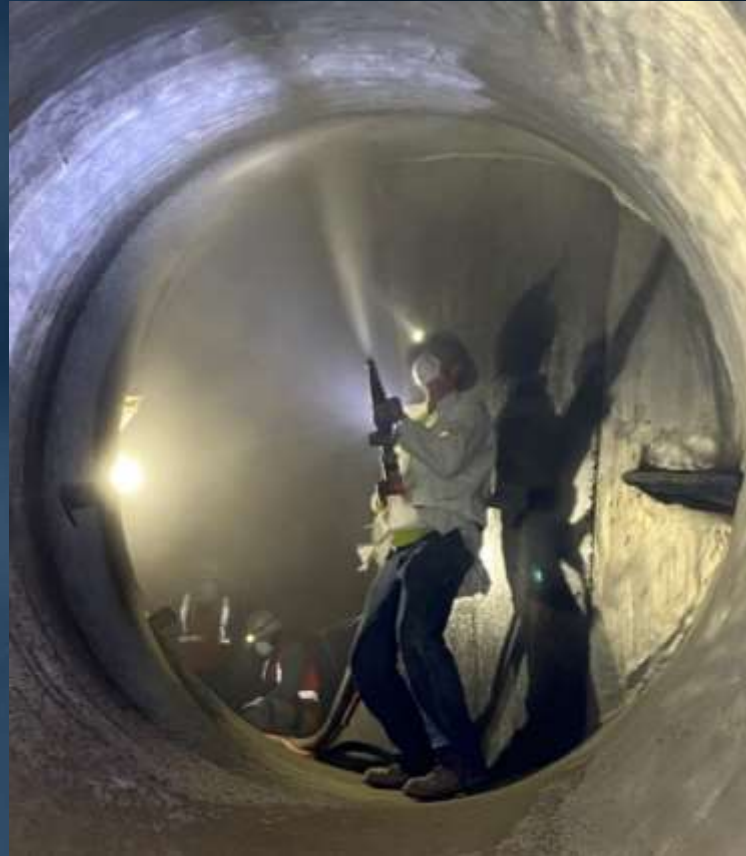
Cement Mortar Installation at Iron Mtn. Pumping Plant