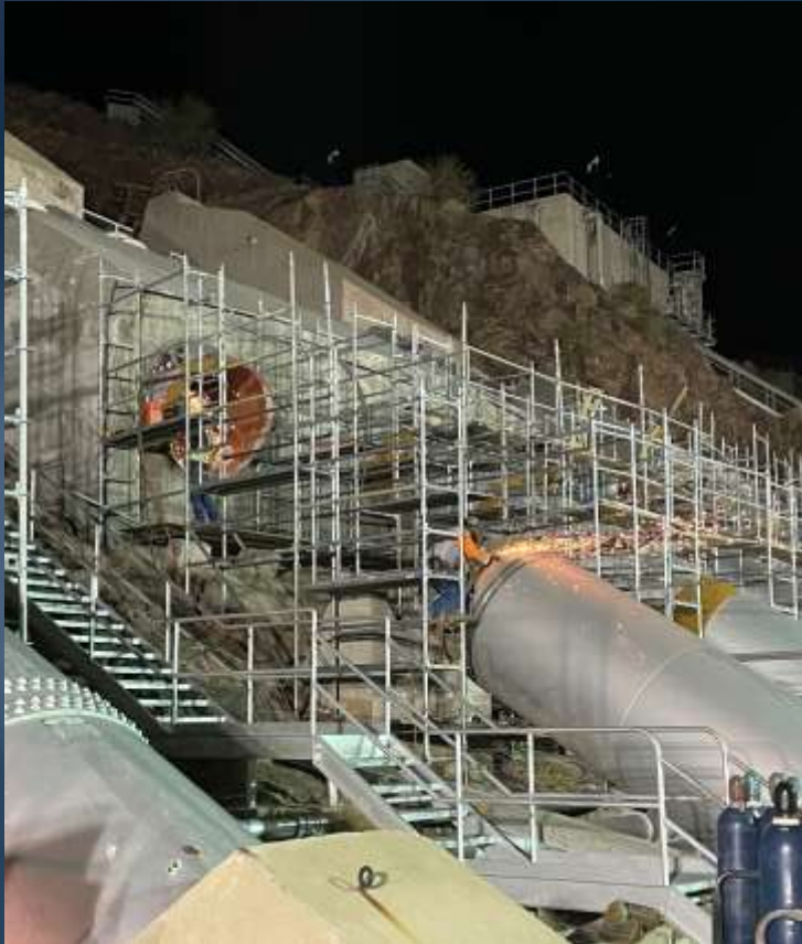
Discharge Line Modification at Intake Pumping Plant