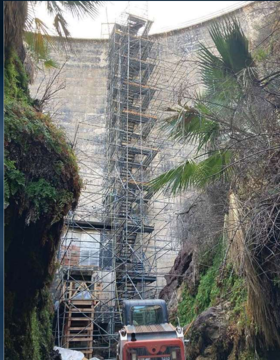
Installation of temporary scaffolding