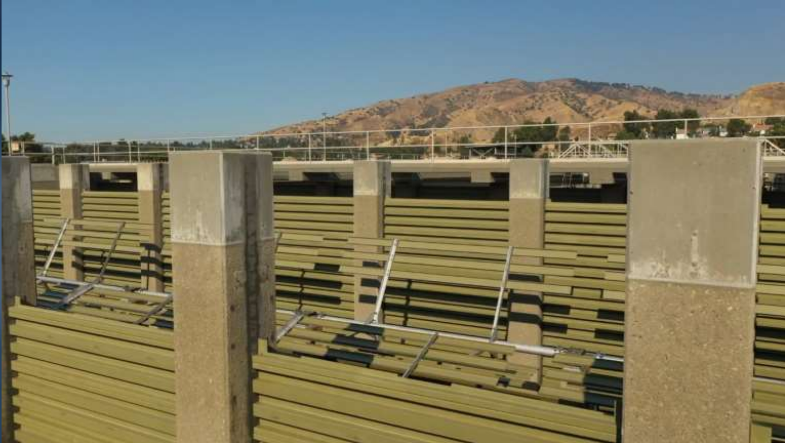
Completed Flocculator Basins at Jensen Plant