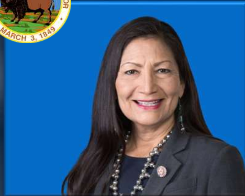
Interior Secretary Deb Haaland