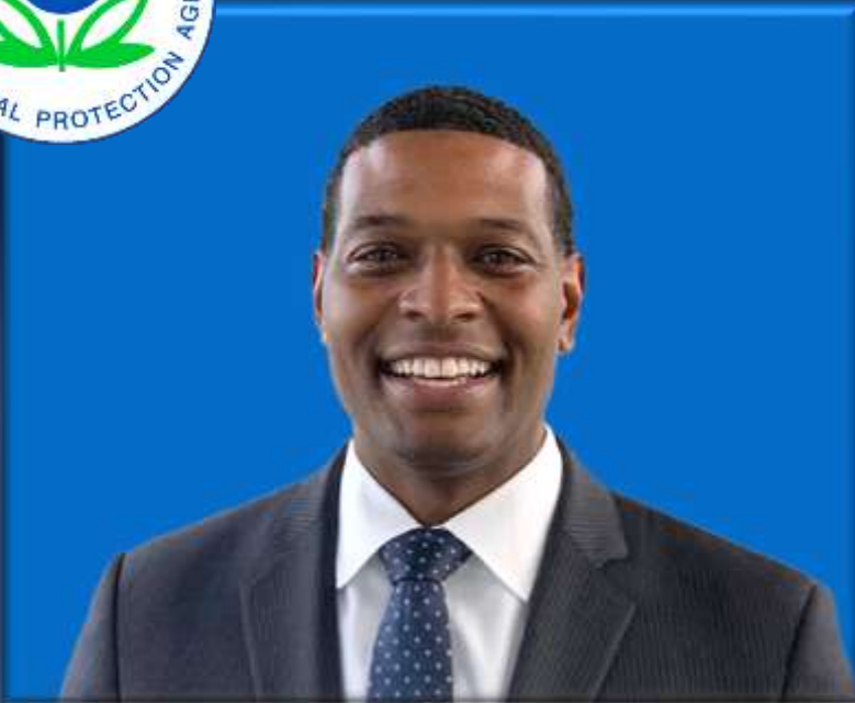
EPA Administrator Michael Regan