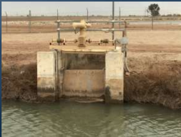
System Operational Improvements