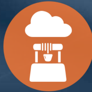
Groundwater Recovery (1991)