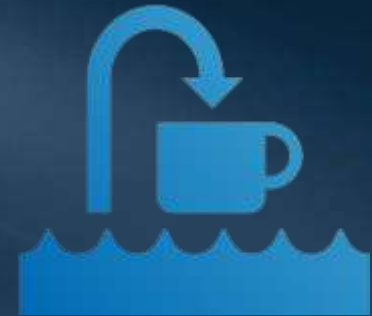
Seawater Desalination (2014)