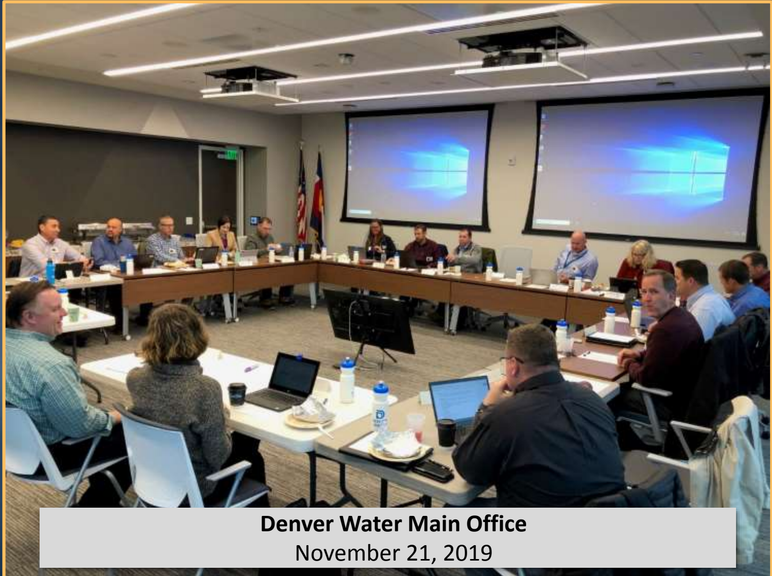
Denver Water Main Office November 21, 2019