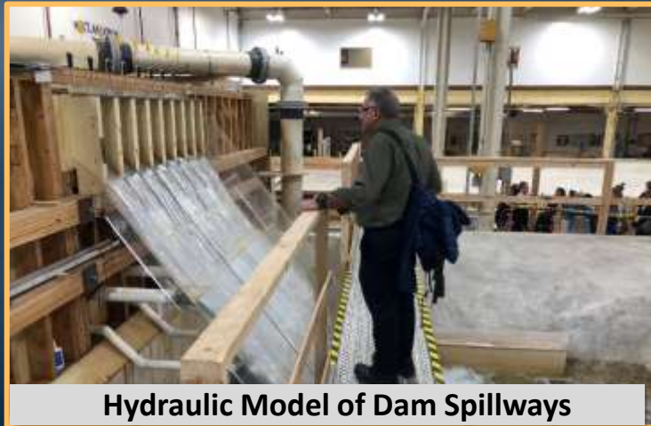
Hydraulic Model of Dam Spillways