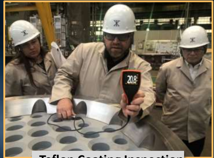
Teflon Coating Inspection