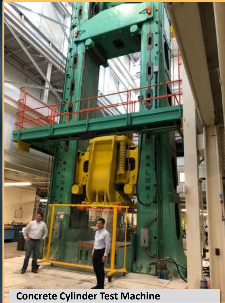
Concrete Cylinder Test Machine