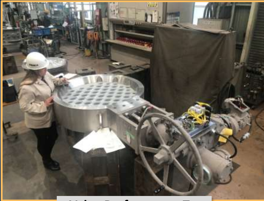
Valve Performance Test