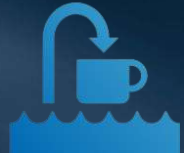
Seawater Desalination (2014)