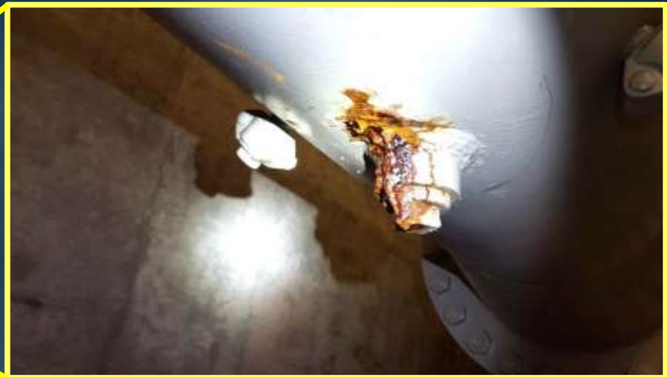
Leak under Venturi Meter