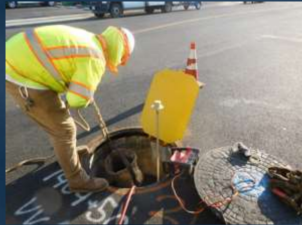
Met staff preparing feeder for dewatering