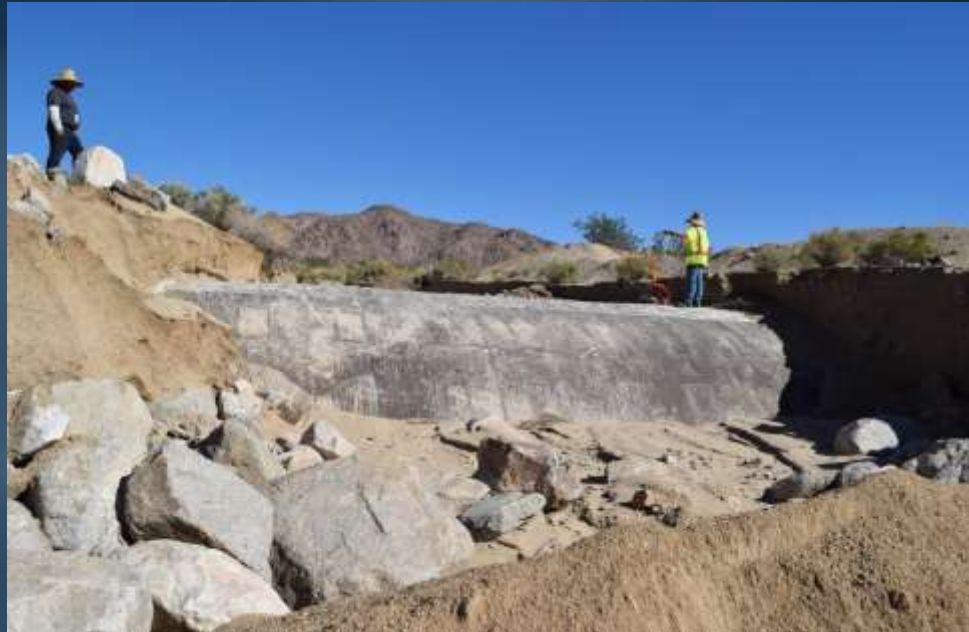
Storm damage: exposed CRA barrel Nov. 2018