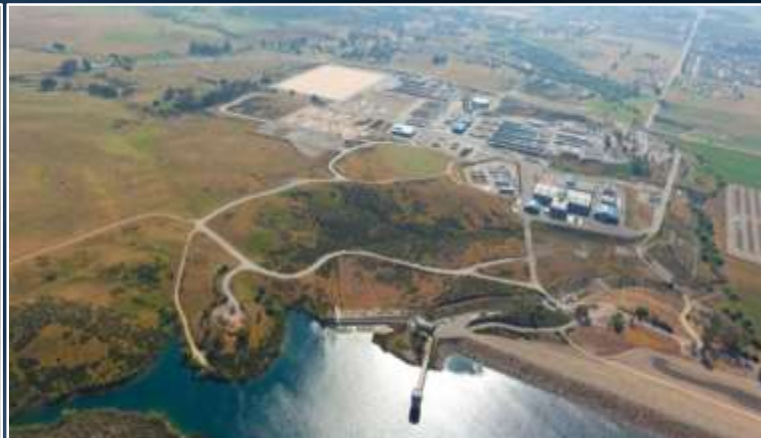
Skinner Water Treatment Plant