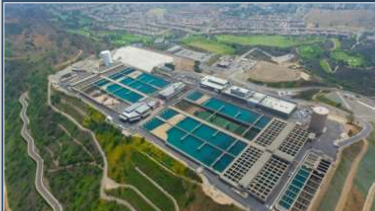
Diemer Water Treatment Plant