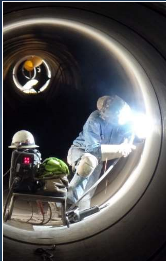
Second Lower Feeder PCCP Relining