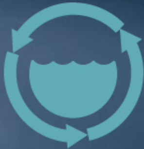
Recycled Water (1981)

Provides incentives for Metropolitan's member agencies to develop new local projects to reduce demand on imported water deliveries.