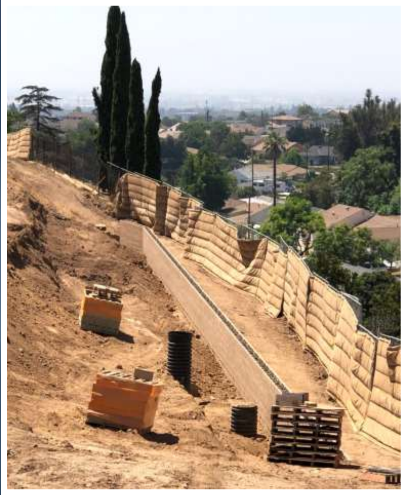
Area 3 Block Wall & Drain