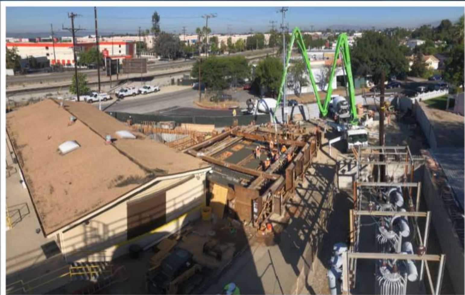
Electrical Vault Deck Placement