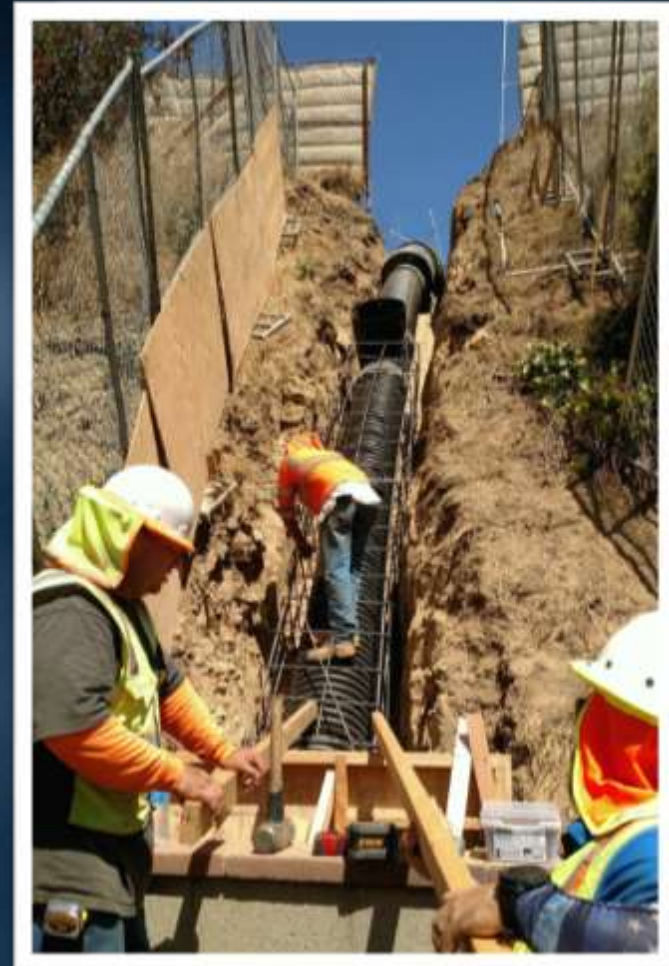
Area 2 Storm Drain