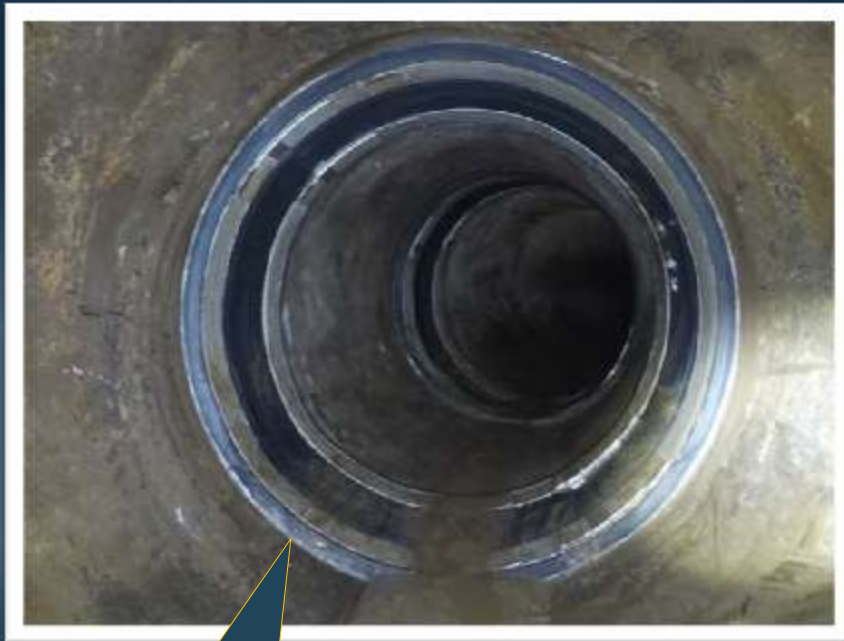
New Weko Seal