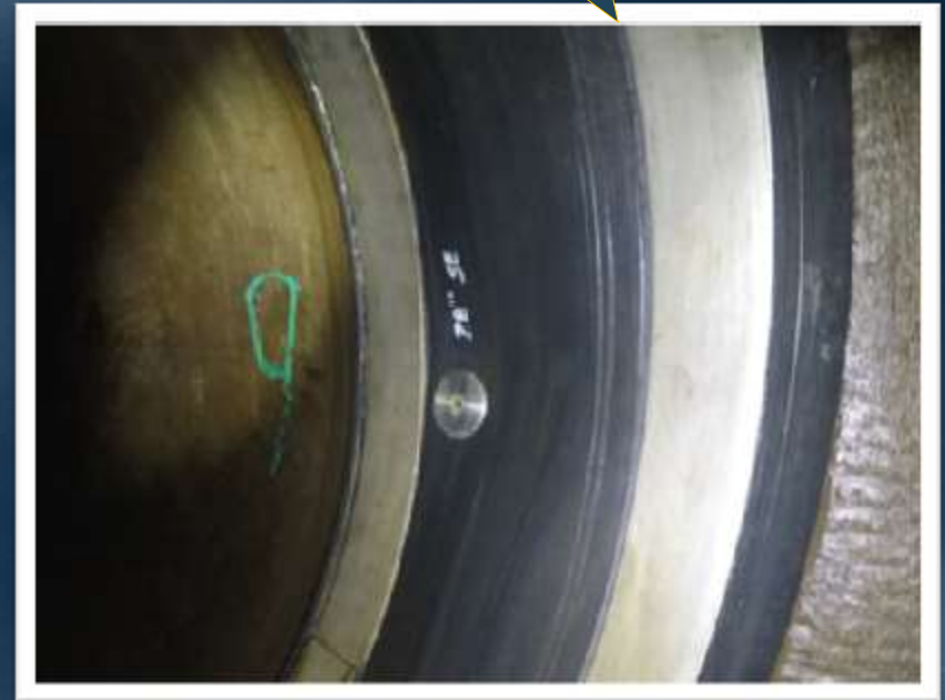
Weko Seal Detail (EPDM & Stainless Steel)