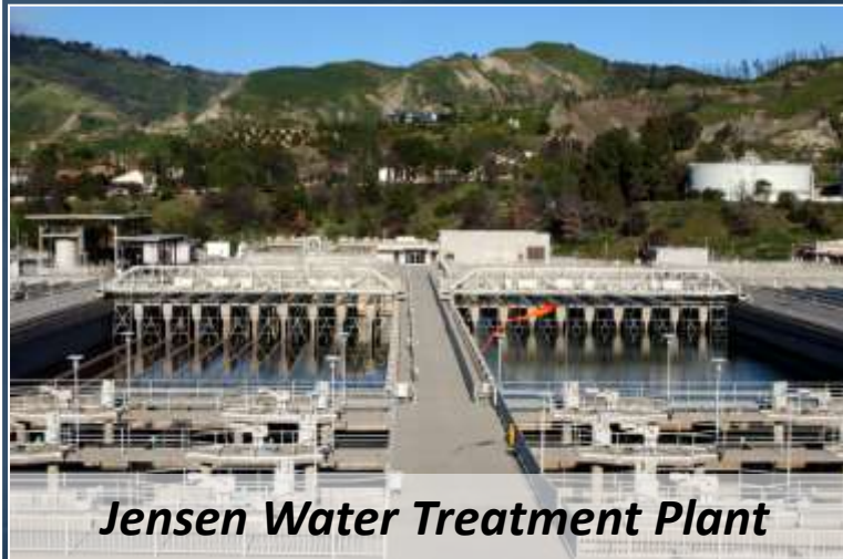
Jensen Water Treatment Plant