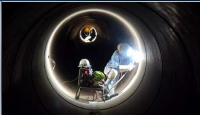
Second Lower Feeder PCCP Relining