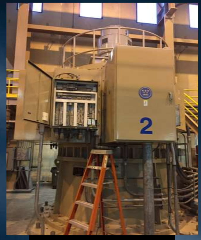
Unit #2 pump/turbine