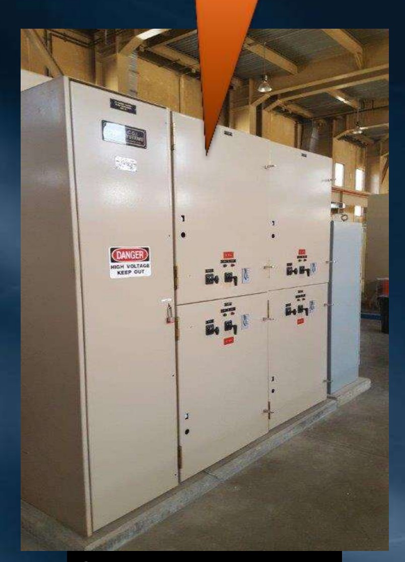
Circuit breaker cabinets