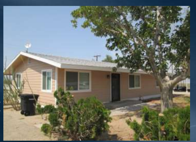
Example of updated exterior