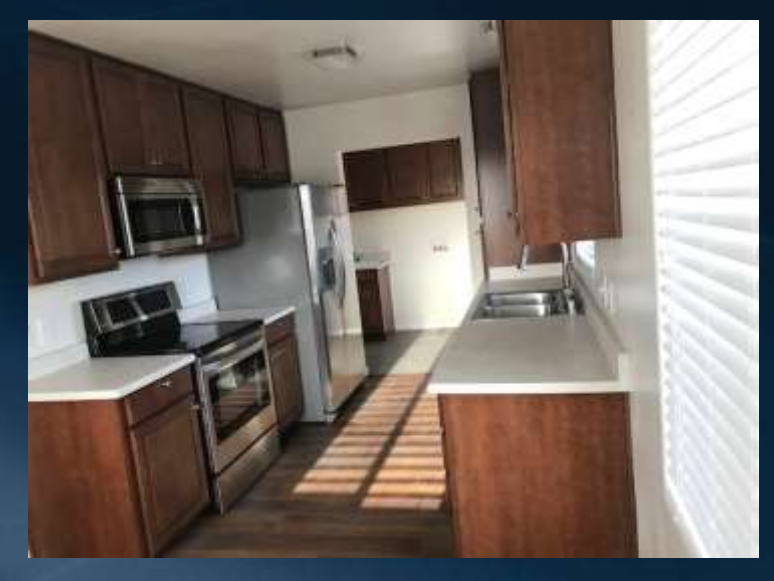
Example of updated kitchen