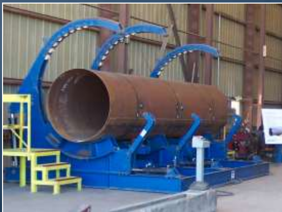
Collapsible steel liner being fabricated