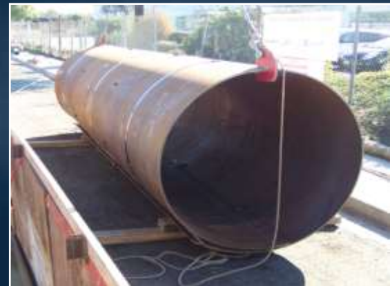
Collapsible steel liner ready for installation