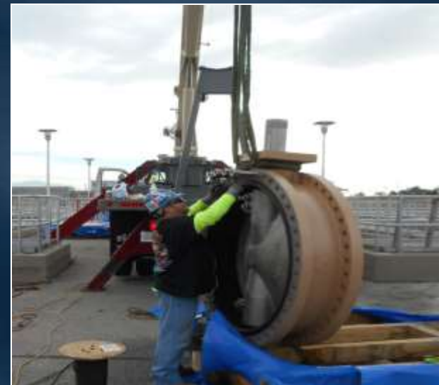
48-in dia. Drain Valve