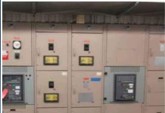
Mills Electrical Upgrades