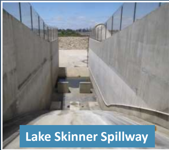
Lake Skinner Spillway