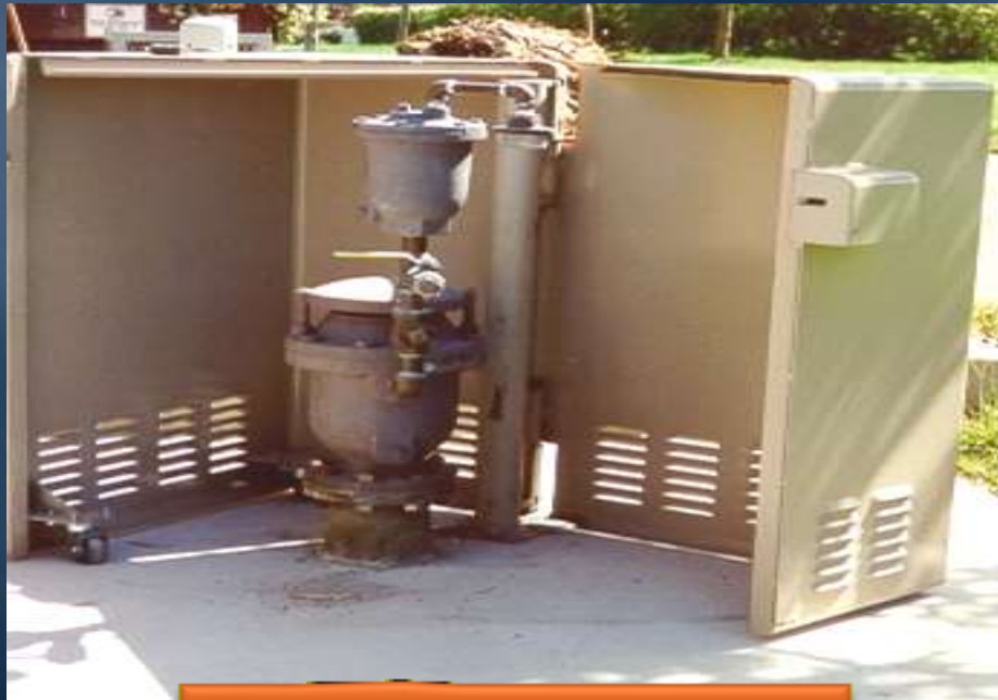
Air Release/Vacuum Valve