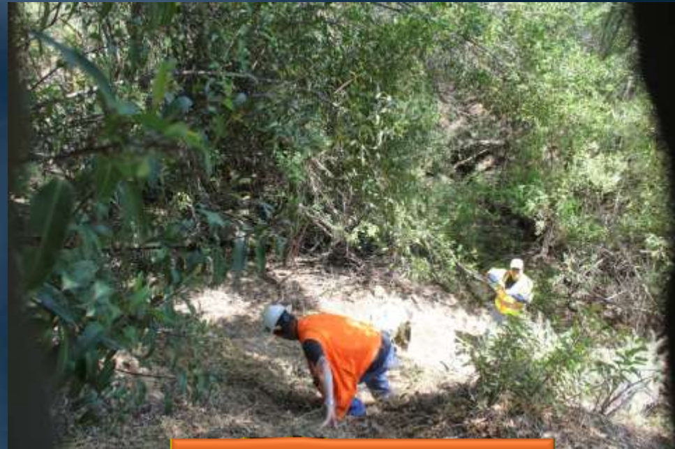
Current Access on Foot