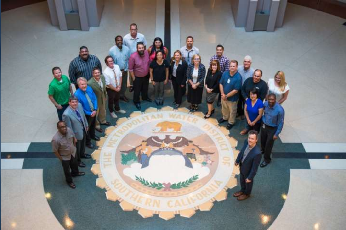
WSO Management Academy Graduating Class of 2016