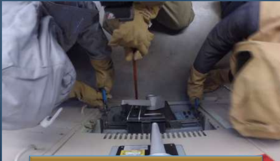
Return of Breaker to Service