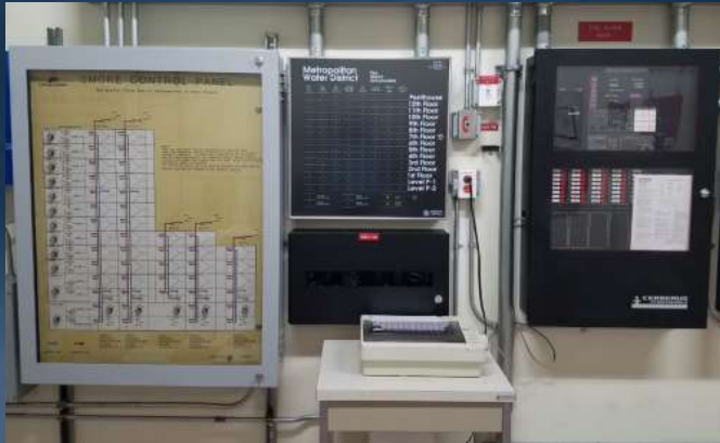
Fire/Smoke Control System

Improvements to be concurrent with seismic upgrades