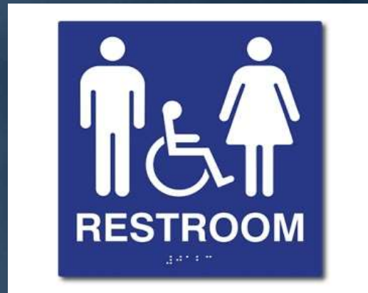
Restrooms (3 rd and 4 th floors)