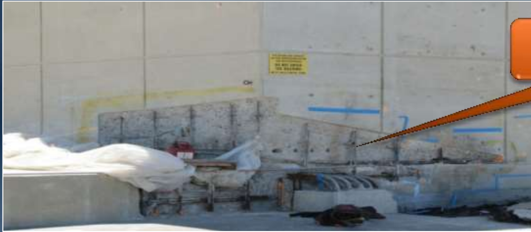
Damaged Concrete at Bldg Exterior