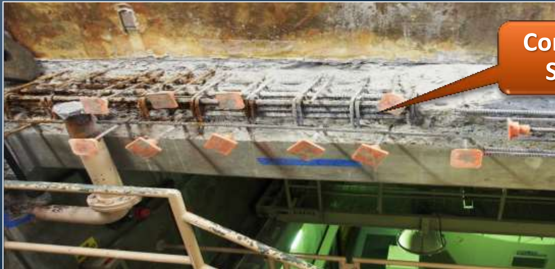
Corroded Reinforcing Steel Within Bldg