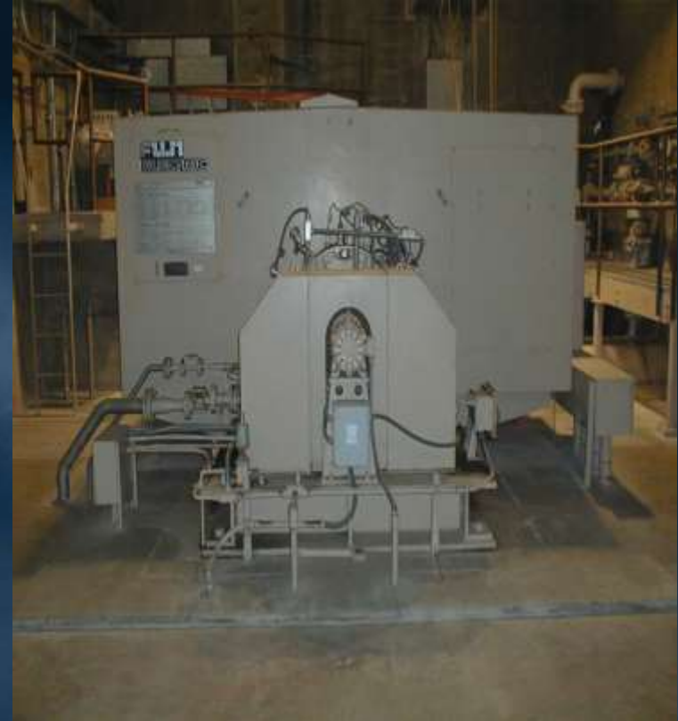
Coyote Creek HEP