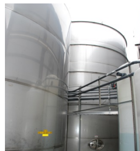
Large stainless steel tanks used to store recycled industrial water