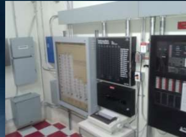
Fire Control System