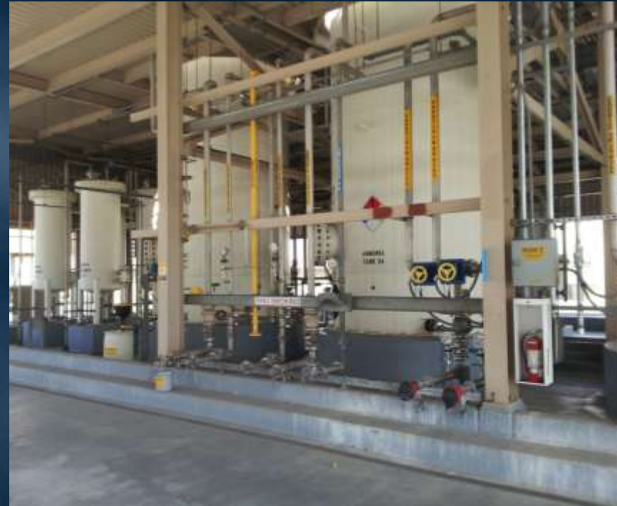
Mills Aqueous Ammonia Facility