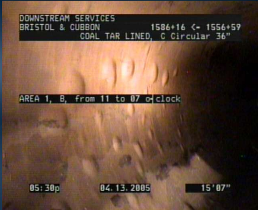
Blistering of Coating