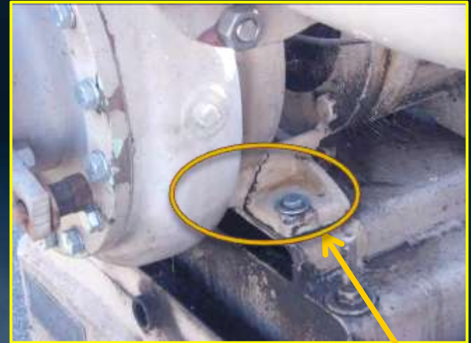
cracked pump housing