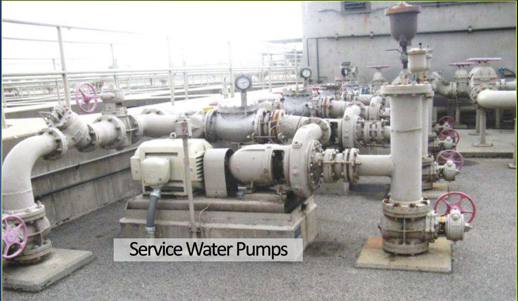
Service Water Pumps

Service water pumps supply filtered water for chlorine disinfection & chemical feed systems