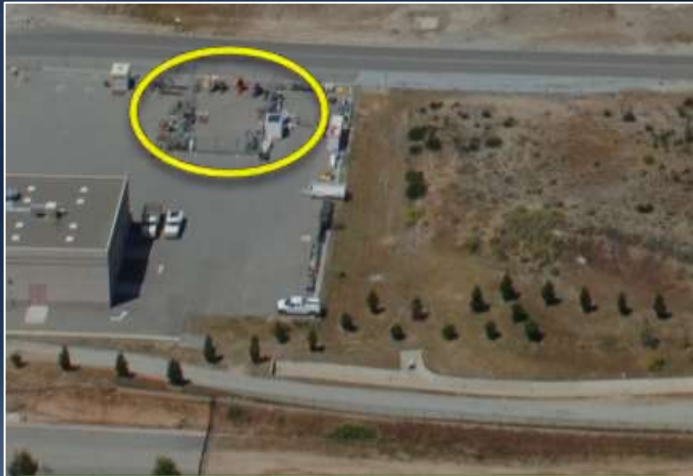
Existing Hazardous Waste Staging Area