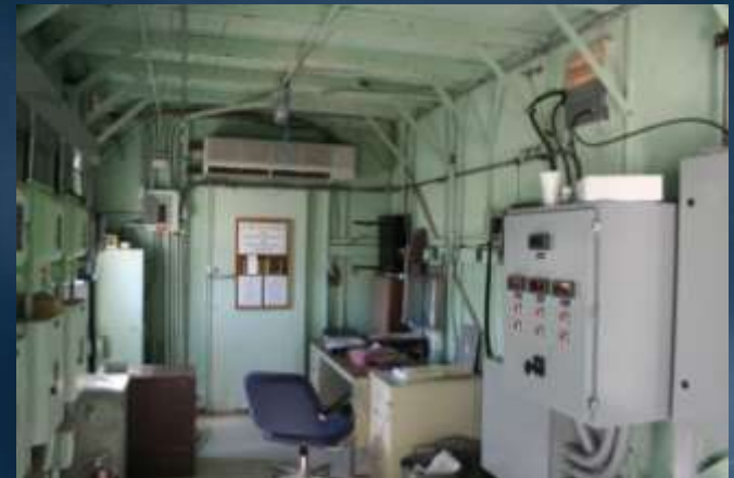
Electrical Bldg. & Equip.