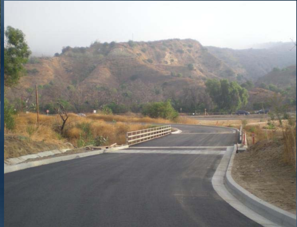
Paved roadway at Carbon Canyon Creek Bridge