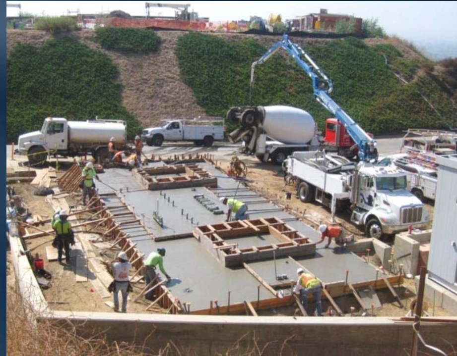
Unit Power Center slab construction