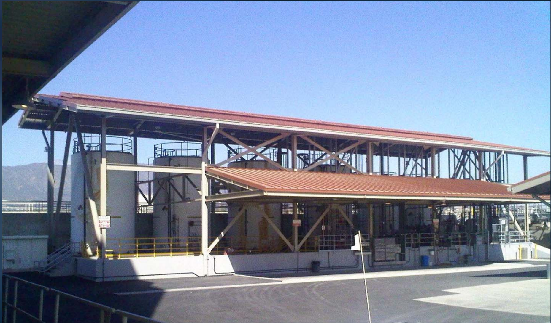
Completed canopy structure