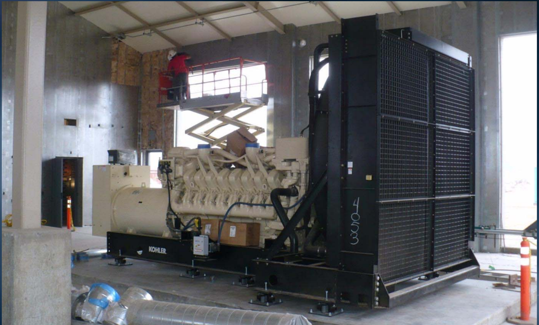
New 2250 kW Diesel Standby Generator