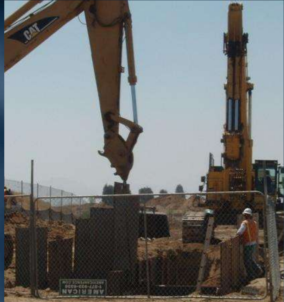
Construction south of Cactus Ave.