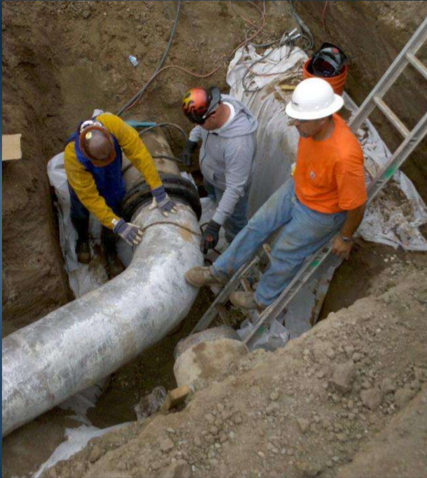
Tie-in to potable water pipeline