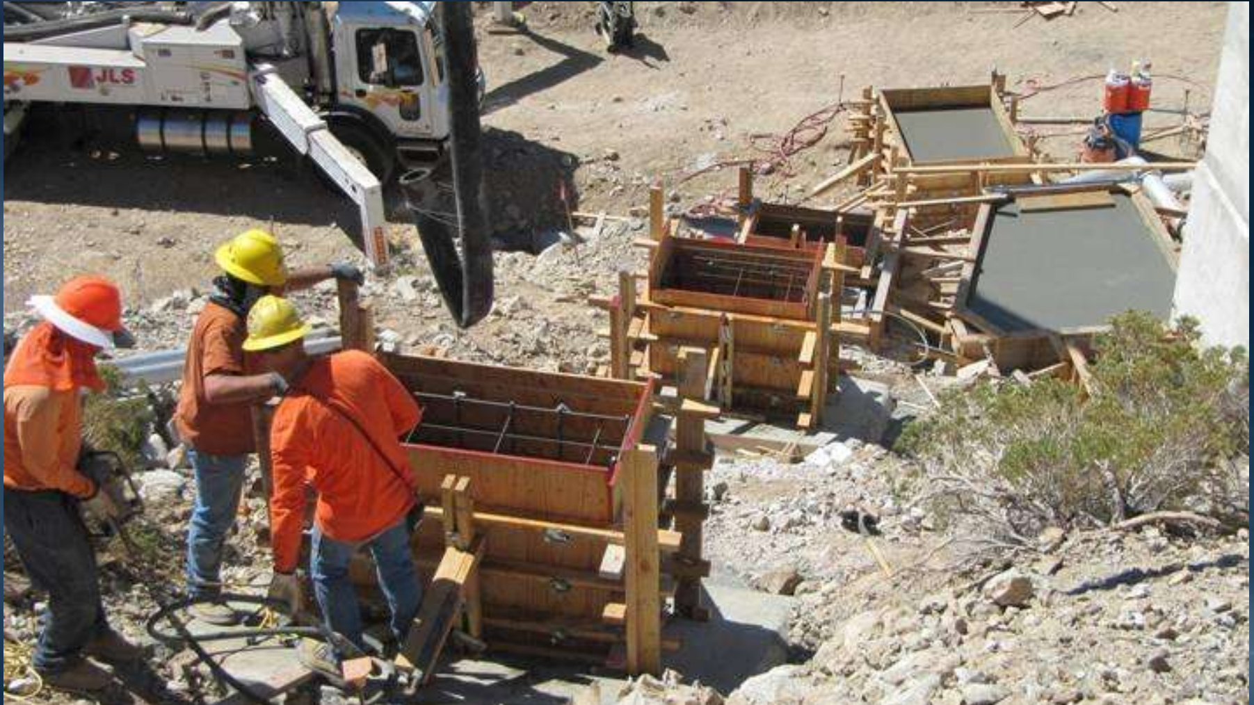
Pouring concrete for stairway landing and piers