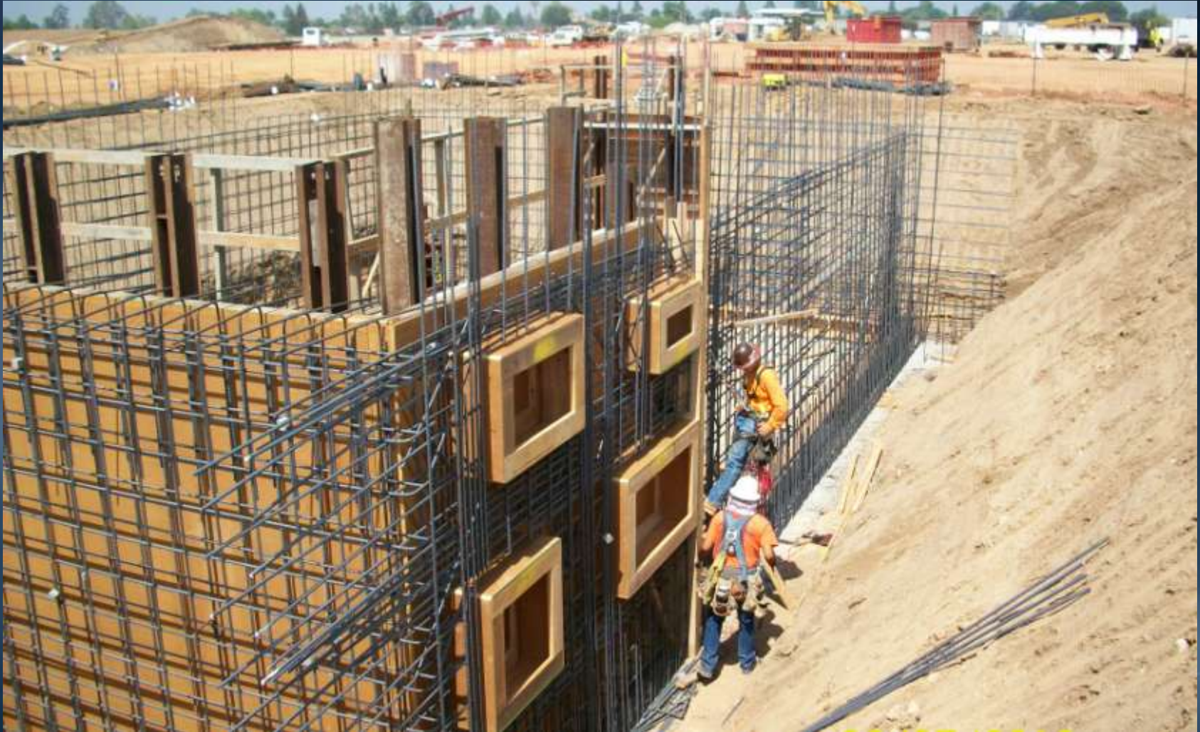
Wall forms for ORP Switchgear Building