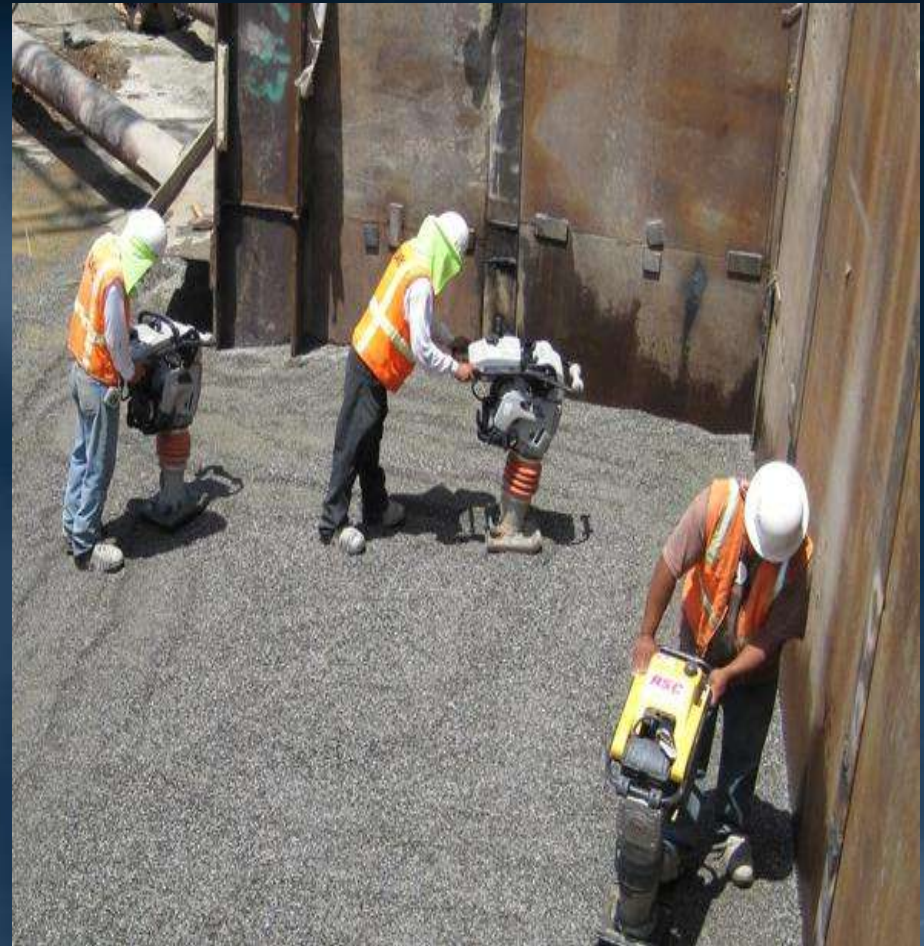
Backfill of inlet conduit