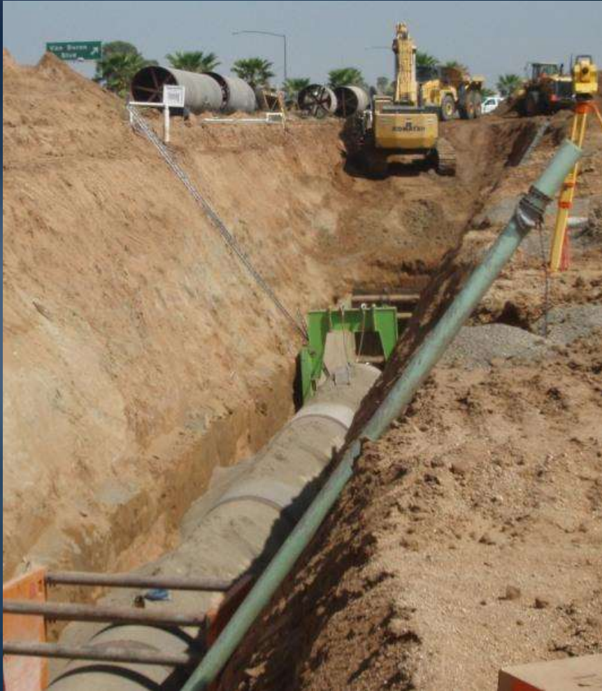
Construction near March Air Museum.