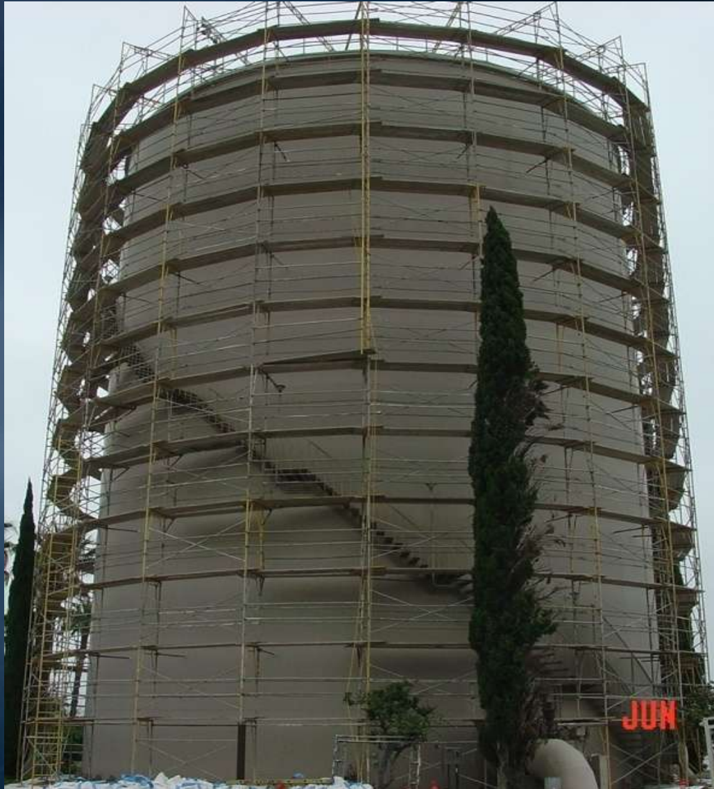
East Tank scaffolding