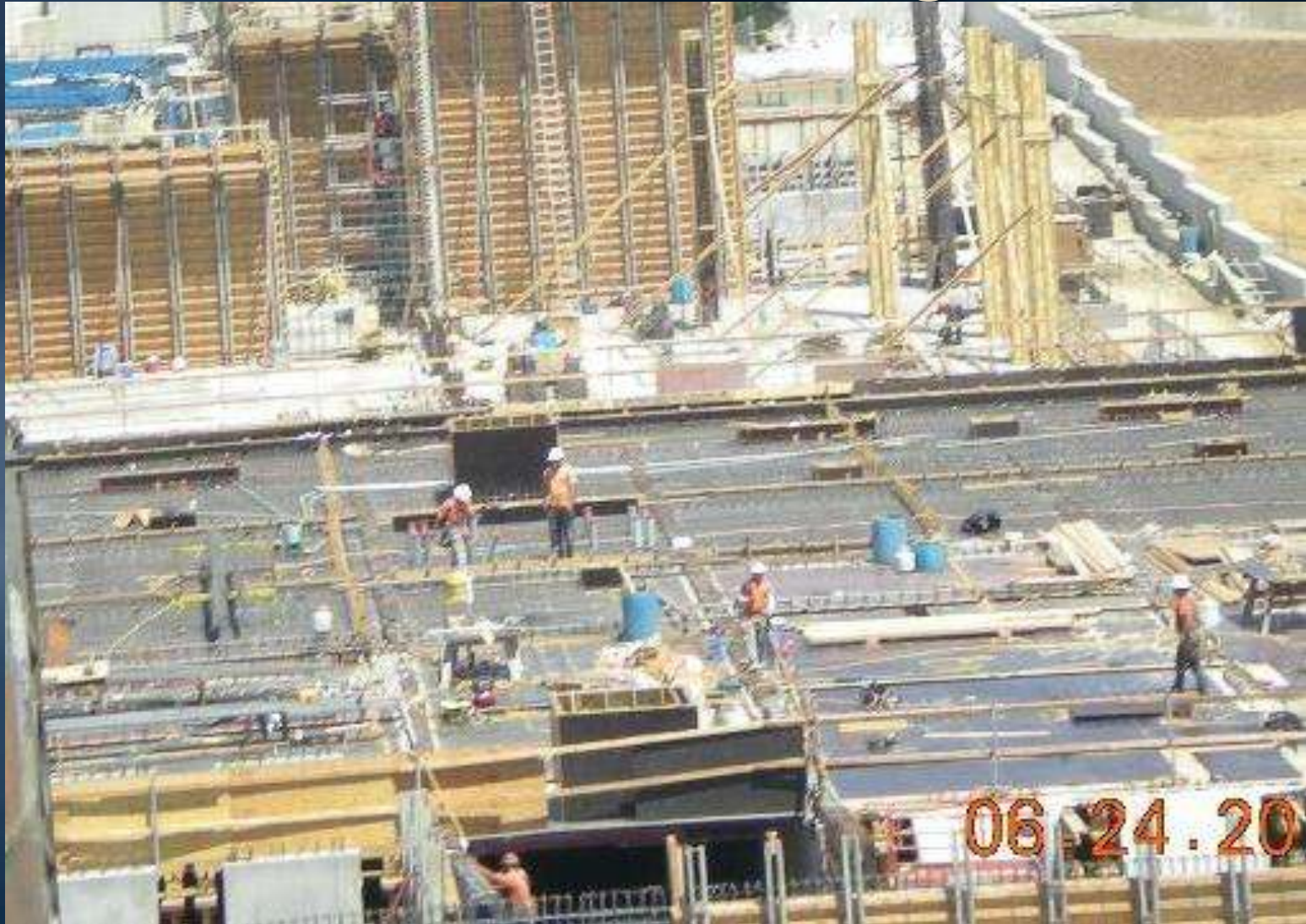
Construction progress in the Ozone Building