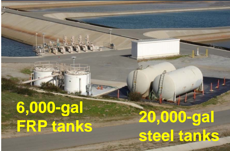
6,000-gal FRP tanks