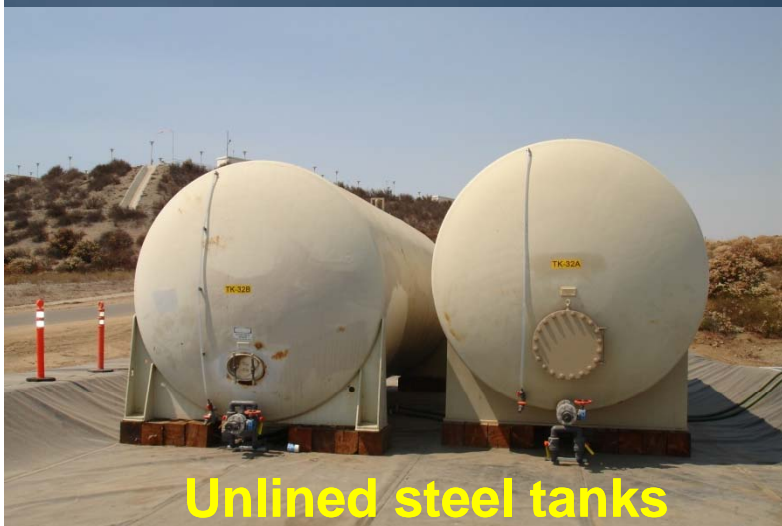
Unlined steel tanks