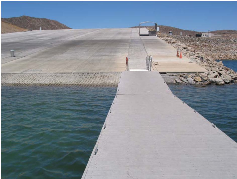
Figure 1: Floating docks and marina ramp – Looking Northeast

The project is under budget and will be completed by mid-January 2005, ahead of the original completion estimate of March 2005.