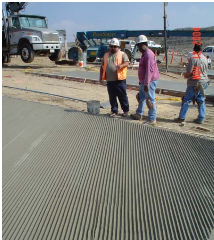
V-grooving finish on the boat concrete slabs.