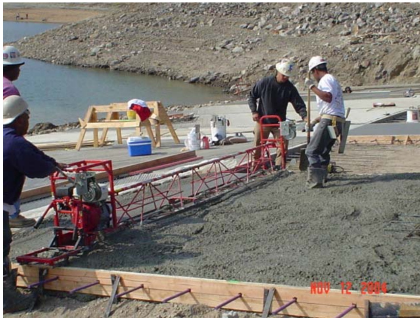
Boat ramp placement of concrete slabs.